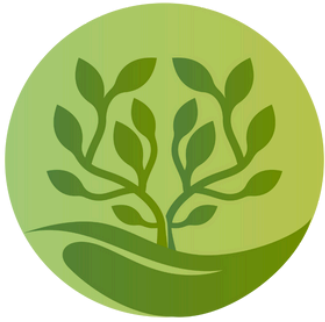
CRECE Rising to Our Leadership Potential

Together, we'll uncover powerful strategies to bridge sectors, adapt to the evolving workplace, and amplify diverse voices. Each session is packed with actionable insights and practical tools to advance equity, foster inclusion, and ignite the next generation of leaders.