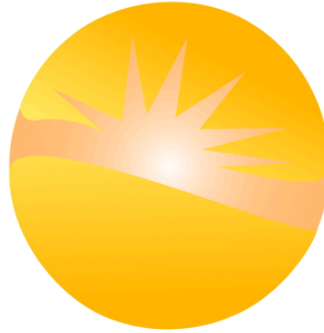
INSPIRA Inspiring Transformative Change