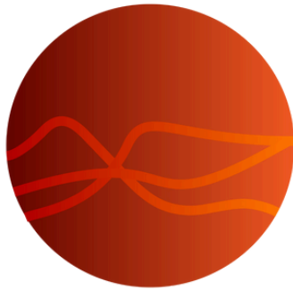
CONECTA Pathways of Talent & Opportunity